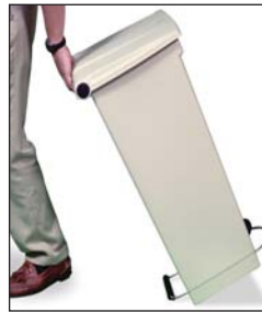
Rear roller on E provides stability and easy transport.