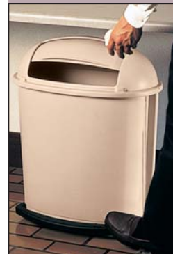
Roll top lid opens easily without the need for overhead clearance.