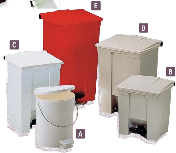
Tight-fitting, overlapping lid has a deodorant block holder.